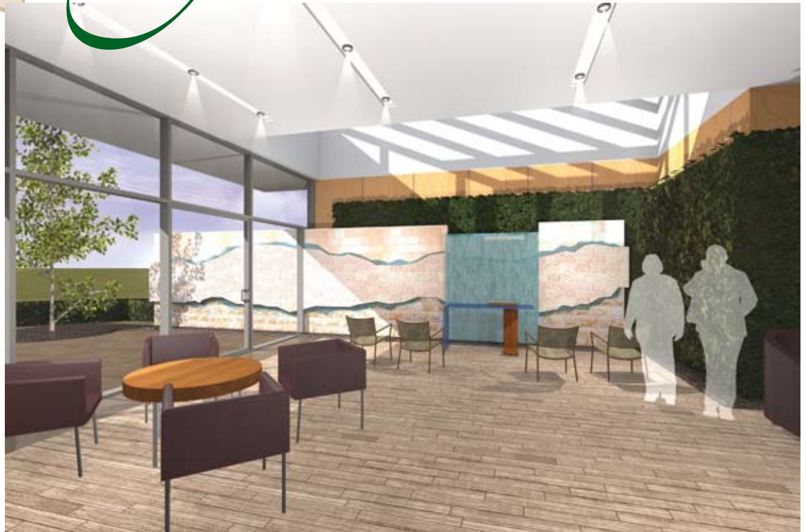
The Jewish Hospice Program will include an addition to Gilchrist Center Towson. Pictured here is a rendering of some of the addition's features, including a Jewish chapel.

gilchristhospice.org • For referrals call: 1.800.HOSPICE