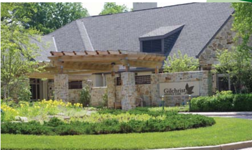
Gilchrist Center Towson celebrates its 20th year.

A celebration for the Towson center will be held in the fall.