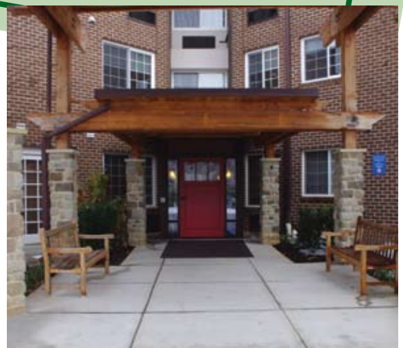
Gilchrist Center Howard County celebrates its 5th year.